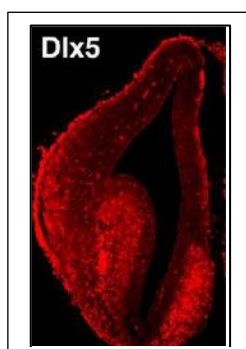
Fig 1. Immunohistochemical staining of Dlx5 in mouse embryonic forebrain.

A. 13.5 forebrain cryo-section was immunostained for Dlx5.